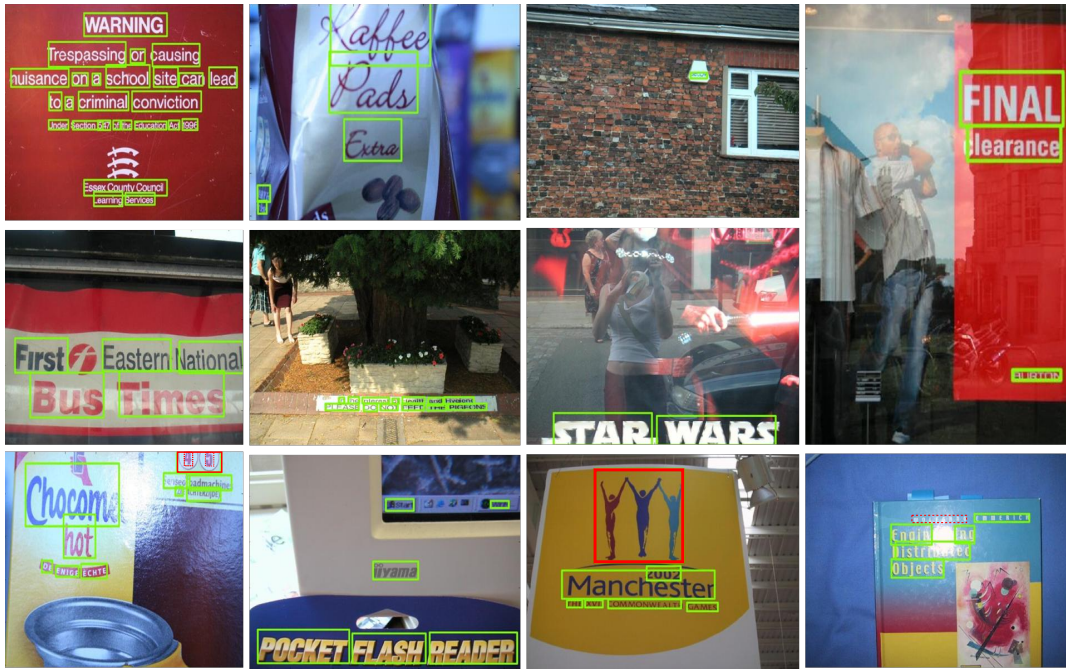
Figure 3: Examples of text localization results. The green bounding boxes are correct detections; Red boxes are false positives; Red dashed boxes are false negatives.