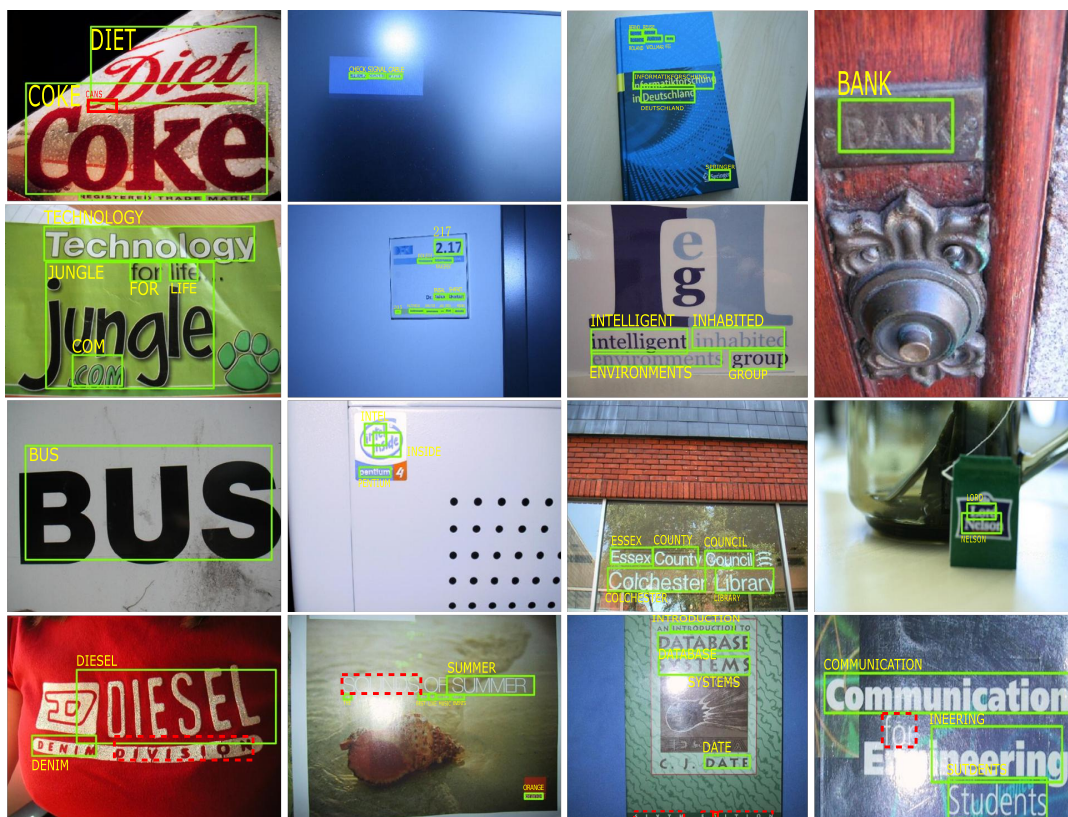
Figure 4: Examples of word spotting results. Yellow words are recognition results. Words less than 3 letters are ignored, following the evaluation protocol. The box colors have the same meaning as Fig. 3.

in Table. 2. The performance gap on SVT is even larger. TextBoxes outperforms the leading method (Gupta, Vedaldi, and Zisserman 2016), by over 8 percents on both SVT and SVT-50. The reason is likely to be that TextBoxes is more robust to the low resolution images in SVT, since TextBoxes is trained on relatively low resolution images.